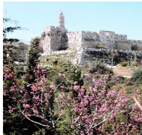
Tower of David