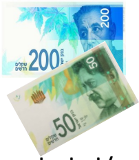
shekel/ Israeli money