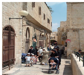
The Old City