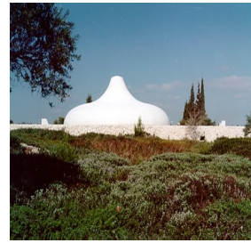
Shrine of the Book