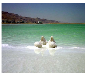
The Dead Sea