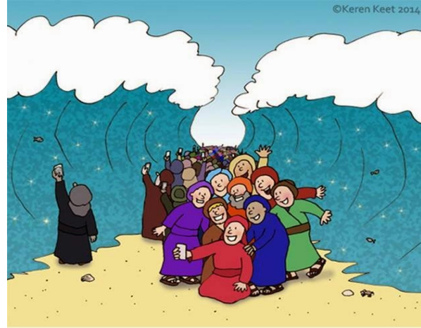
If there were cellphones at the Red Sea

DURING THE JEWISH HOLIDAY OF PASSOVER, KIDS SEARCH FOR A HIDDEN PIECE OF MATZAH CALLED THE "AFIKOMEN." WHOEVER FINDS IT GETS A PRIZE.