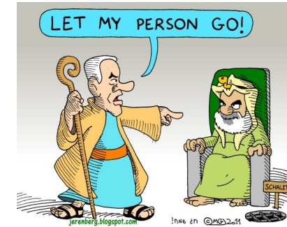
FROM THE DRY BONES HAGGADAH