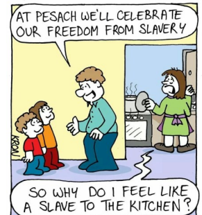
THE CARTOON KRONICLES