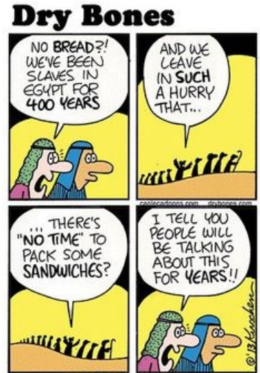
FROM THE DRY BONES HAGGADAH