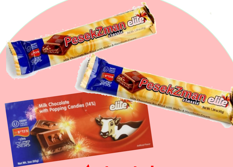
שׁוֹקוֹלָד Elite chocolates