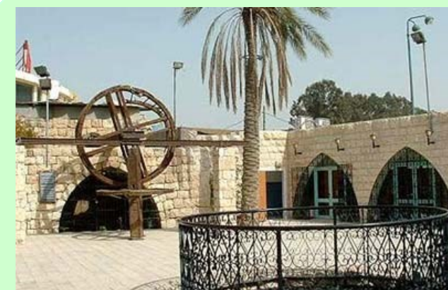
בְּאֵר שֶׁבַע Beersheva