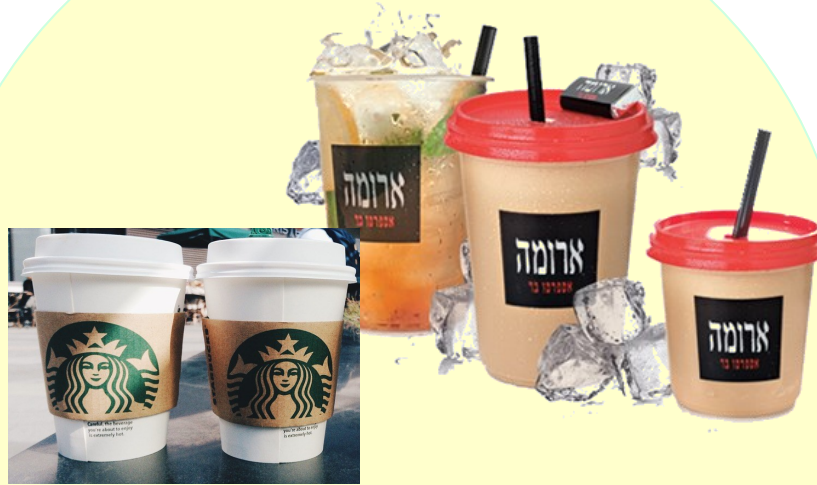
Starbucks / Aroma