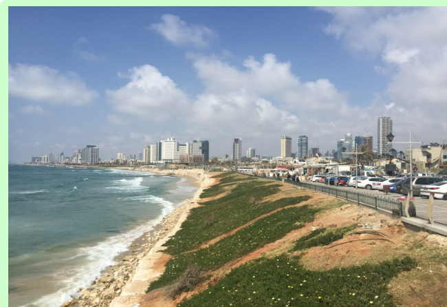
תֵּל אָבִיב Tel Aviv