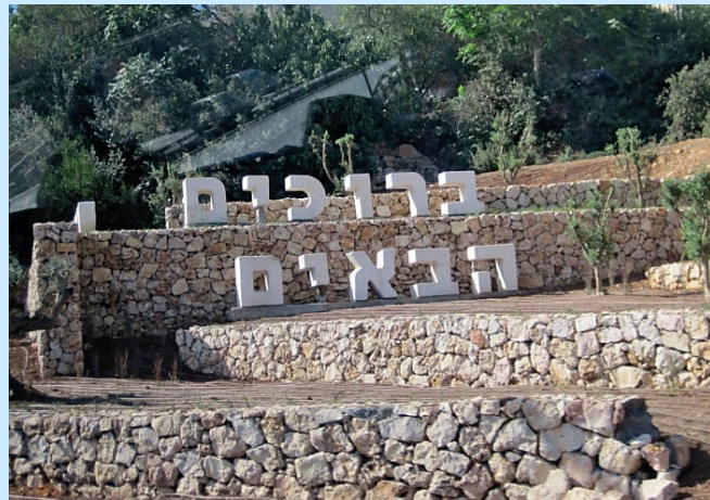
b'ruchim habaim welcome