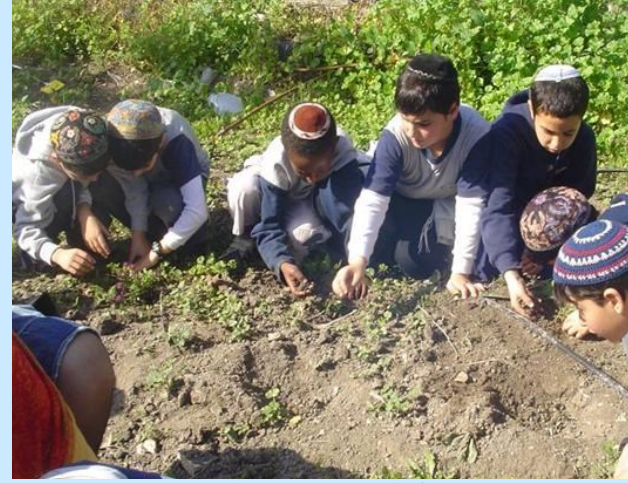
עצים planting trees