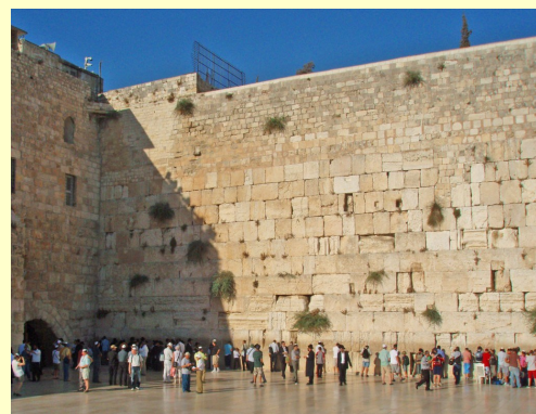
Statue of Liberty / Kotel