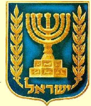
U.S. / Israel seal