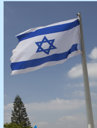
דגל Israeli flag