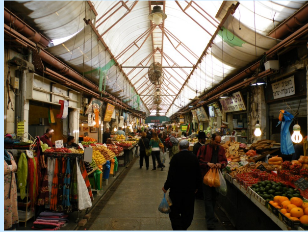
השוק The Shuk