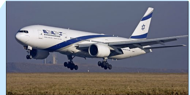
אל על El Al airlines