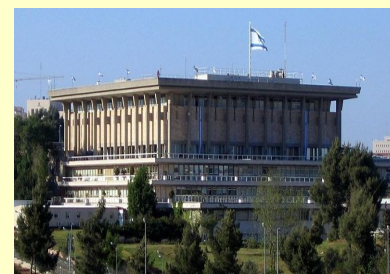
White House / Knesset