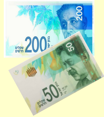
dollars / shekelim