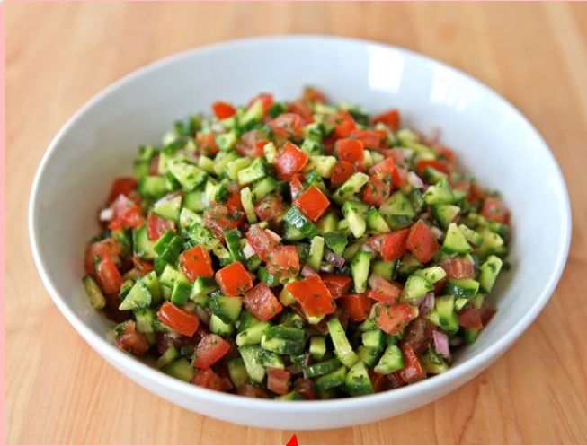
סָלַט Israeli salad